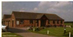
South Kyme Golf Club

Phone: 01526 861113 Fax: 01526 861080 Email: southkymegc@hotmail.com Web: www.skgc.co.uk